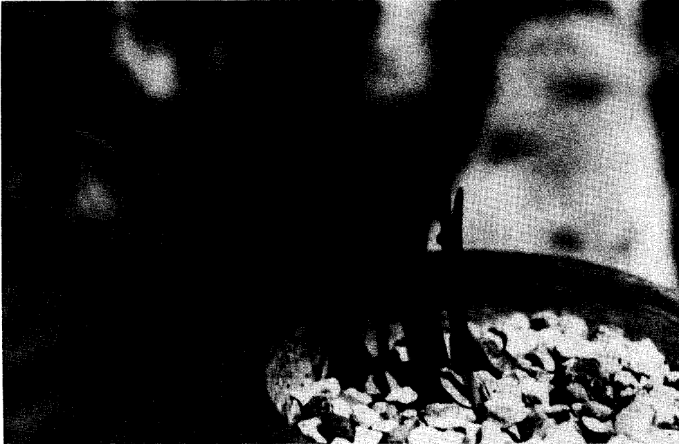
Fig. 2. Flowering individual of Biarum tenuifolium subsp. idomenaeum (cultivated in the experimental garden of the University of Patras).

The new taxon differs from the rest of the B. tenuifolium complex in the E Mediterranean by the linear, strongly undulate leaves forming a rosette appressed to the ground. It can be separated from subsp. abbreviatum by the slender, evenly distributed staminodes.