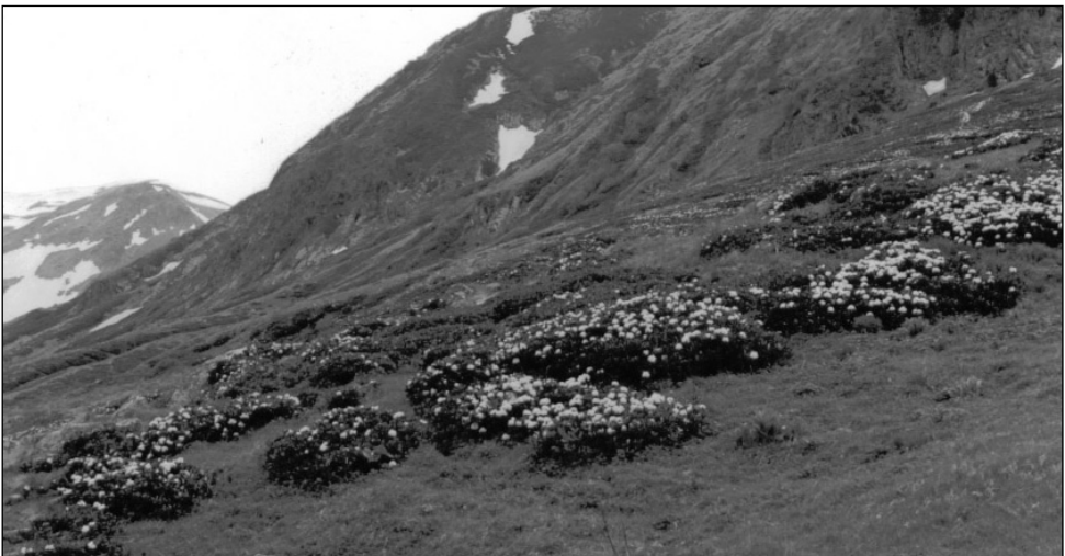
Fig. 4. Rhododendron caucasicum Pall.

The proportion of the endemic species (212) is (35,4%). Petrophilous flora is distinguished by particularly high degree of endemism. 8 of the 17 endemic genera of the