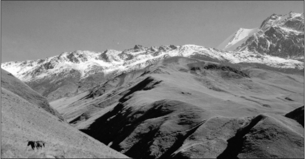
Fig. 3. Gorge of Arkhoti (Gorge of riv. Assa), high mountain landscapes.

Festuca woronowii , Phleum alpinum , Poa alpina , Nardus stricta , Betonica macrantha , Anemonastrum fasciculatum , A. speciosum , Bistorta carnea , Trifolium pratense , T. alpestre , T. canescens , Scabiosa caucasica , Centaurea salicifolia , C. fischeri , Leontodon danubialis , Daphne glomerata , Polygala alpicola , Luzula pseudosudetica , Carex medwedewii , C. lachenelii , C. pallescens , C. tristis ) occur in the high mountains especially frequently.