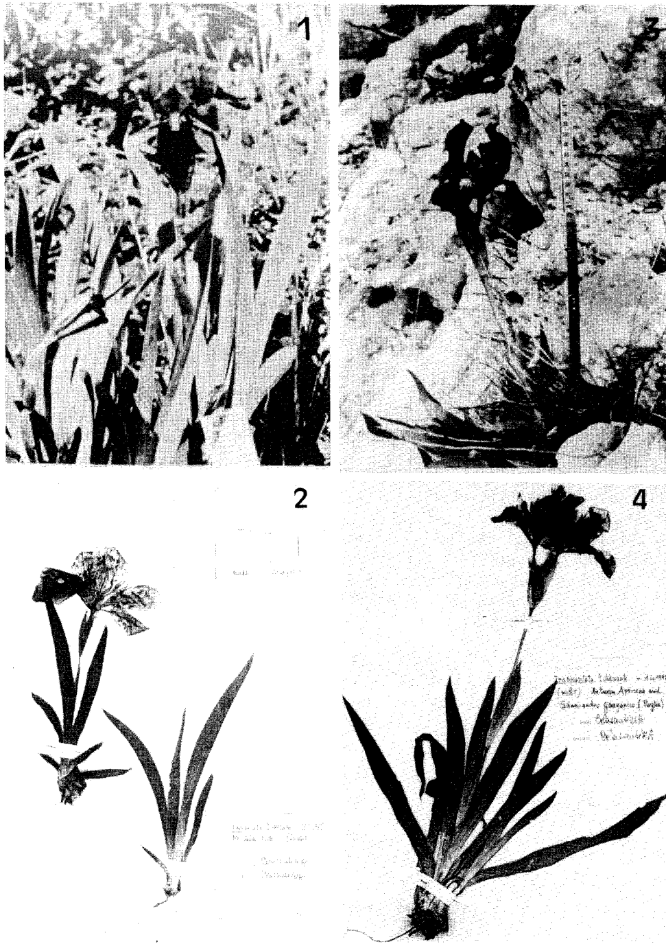
Figs. 1-4. 1 , I. relicta , a living individual in the field; 2 , the neotype; 3 , I. bicapitata , a living individual in the field; 4 , the holotype.